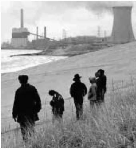
Indiana Dunes National Lakeshore and NIPSCO generating plant.