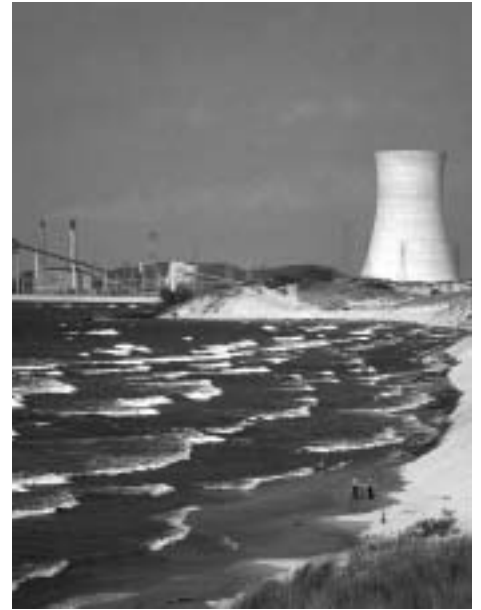
The Indiana Dunes National Lakeshore lies only a few miles from the coal combustion waste in the Town of Pines, next to the smokestacks and cooling towers of the NIPSCO plant.

Sixty-one-year old Gordon Tharp wonders whether the joint problems