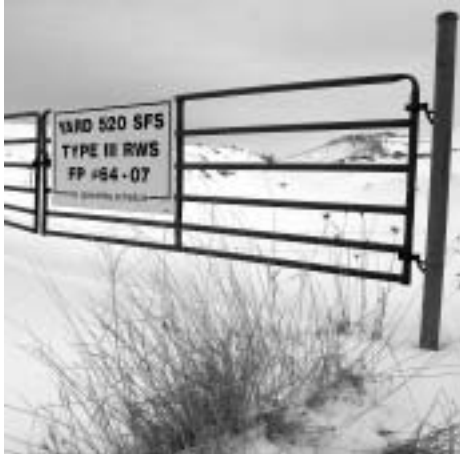
Approximately 1 million tons of fly ash from NIPSCO's Michigan City generating plant was deposited in Yard 520.